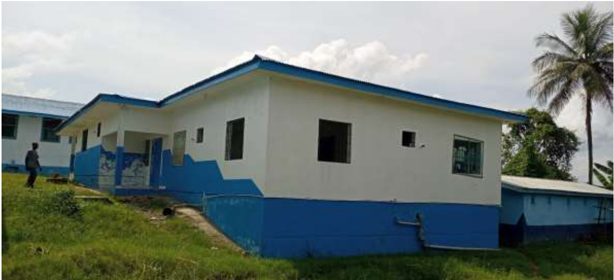
Figure 25.0 Salala Clinic expansion: Project Current Project site (Standard) &Overestimated