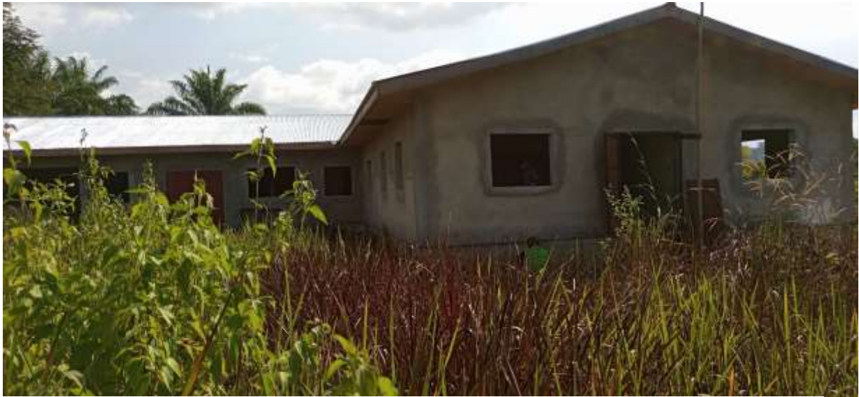
Figure 35. Clinic Completion in Karyata: Project current view (Standard) & Overestimated