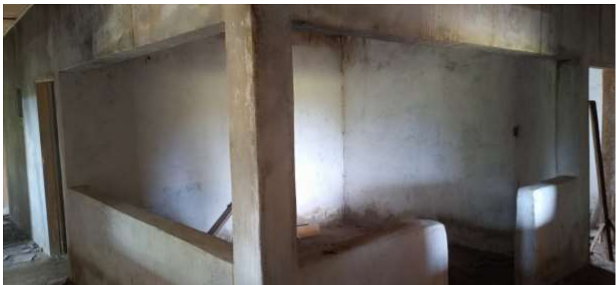
Figure 36.0 Clinic Completion in Karyata: Inside View