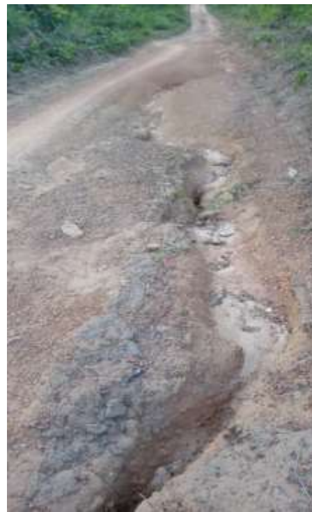
Pictorial of the rehabilitated Meleen-ta Road