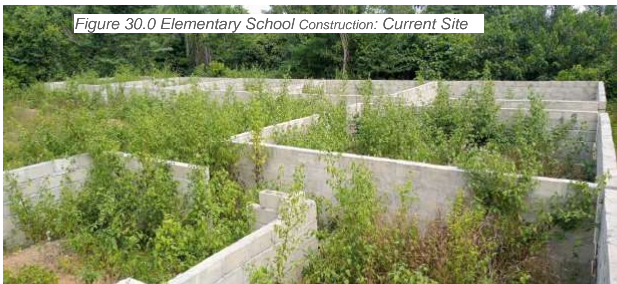
Figure 30.0 Elementary School Construction: Current Site