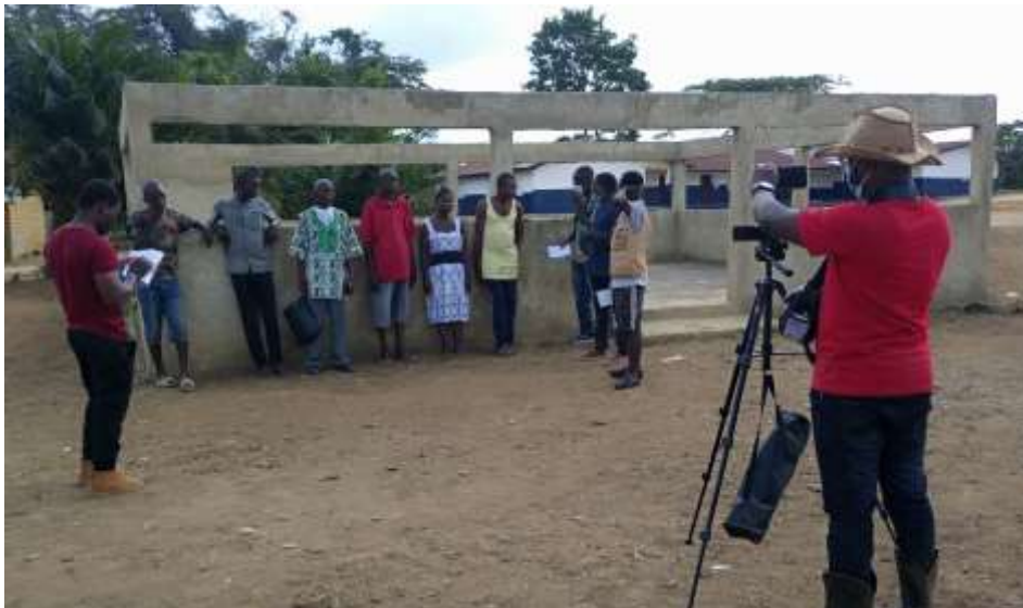
Figure 12.0 Gbarney Town Hall Construction: Current look of the Project Site