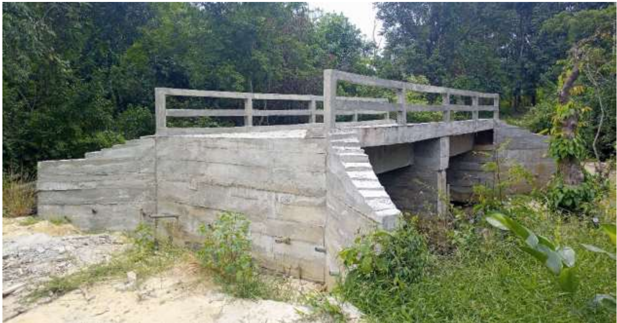
Figure 14.0 Baryata Bridge: Project Current Site View