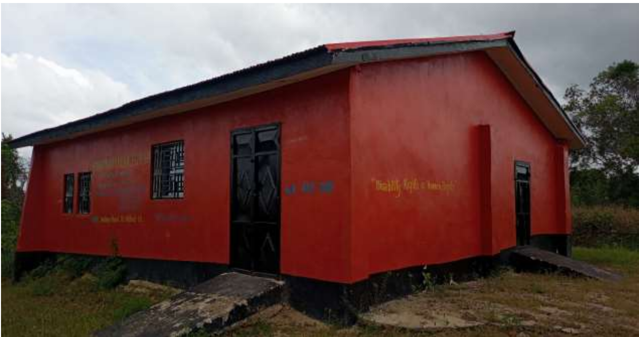
Figure 39.0 Disable Office Renovation: Project Current View

Based on the level of work done and comparing it to the budget for the renovation, the engineer can safely say that the project was overestimated.