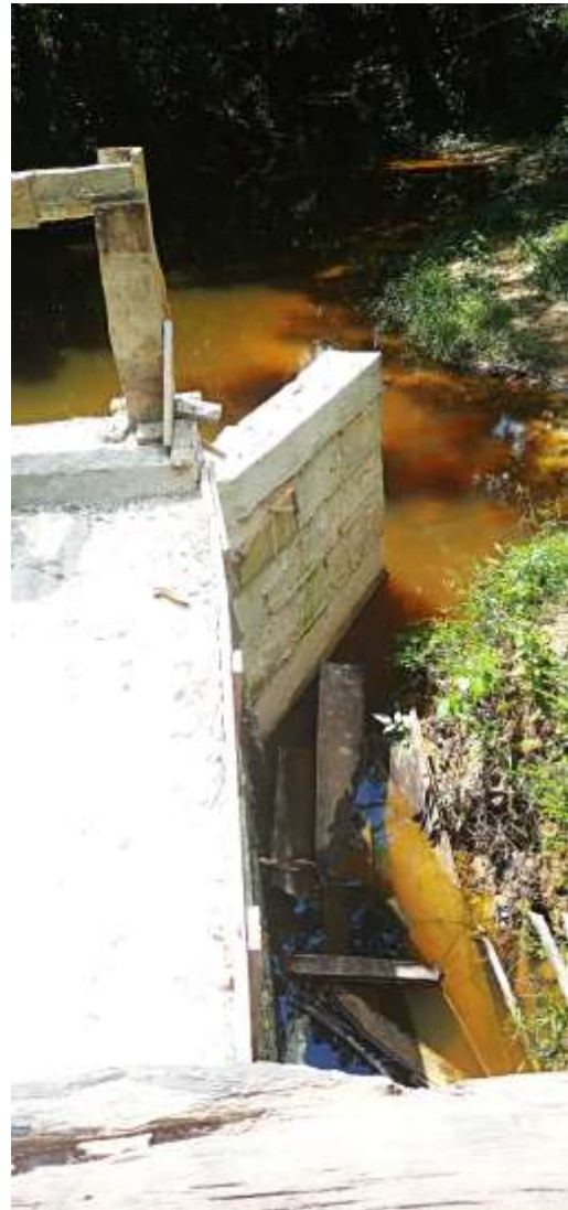
Figure 3.0 Gbarlorkpalah Bridge Project: Wingwall placed far from the water bank (Substandard Work)