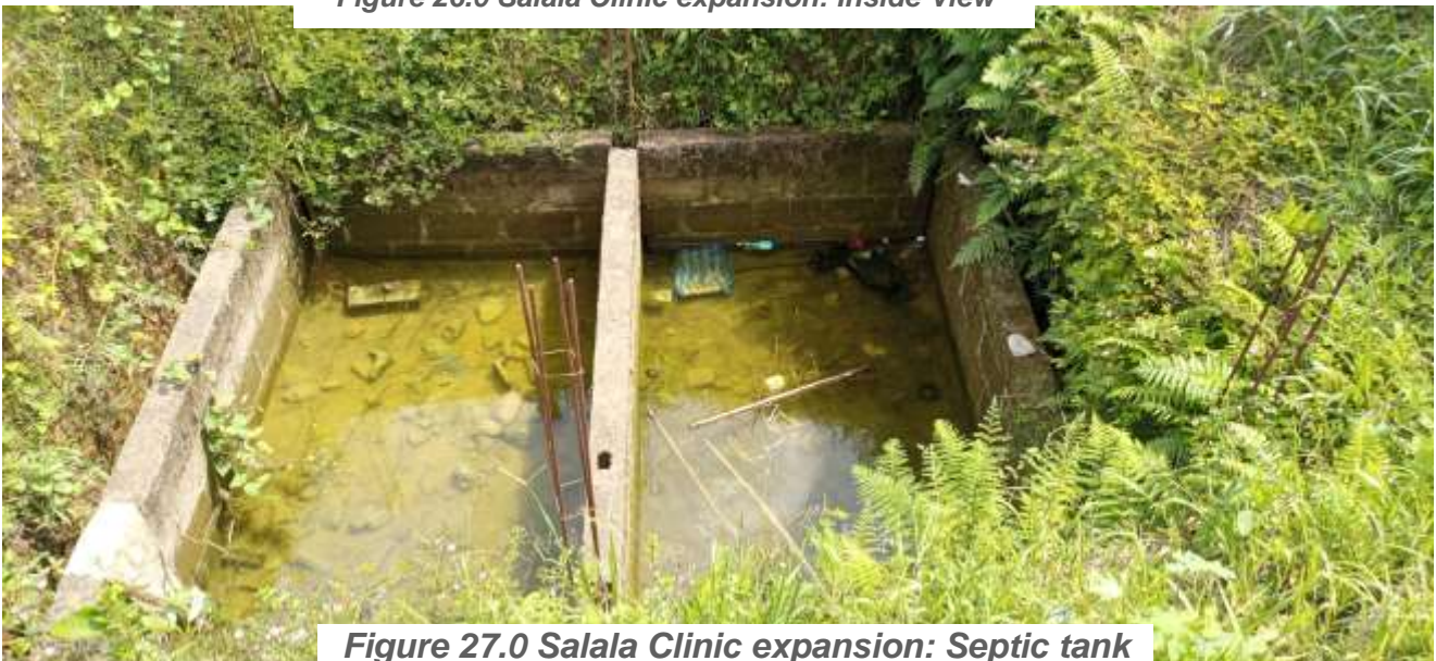
Figure 27.0 Salala Clinic expansion: Septic tank