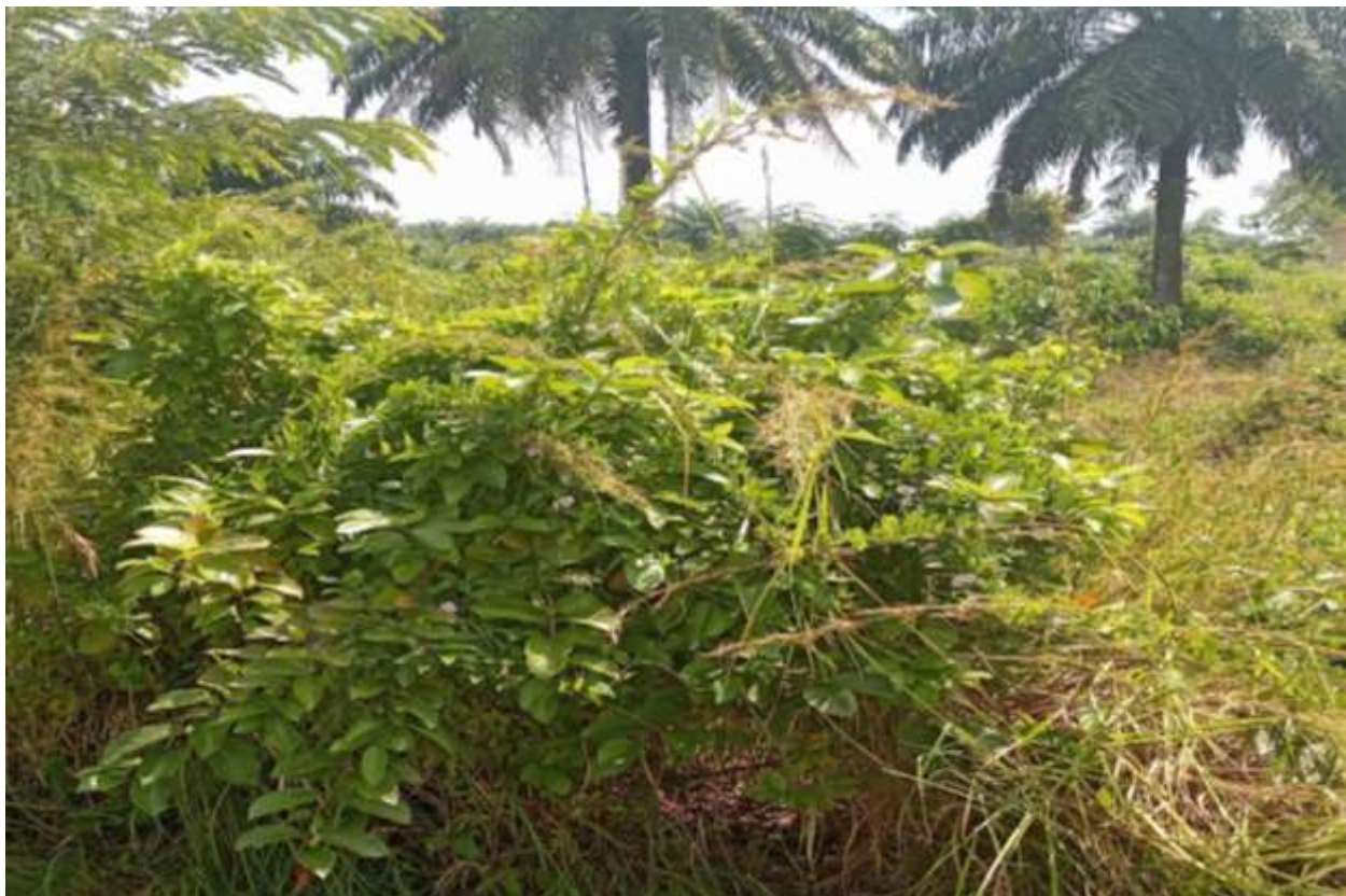
Figure 17.0 Sanoyea maternal waiting home Proposed Project Site