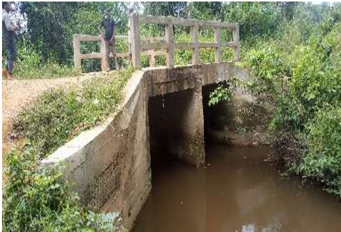
Pictorial of Constructed Sheankpala Bridge