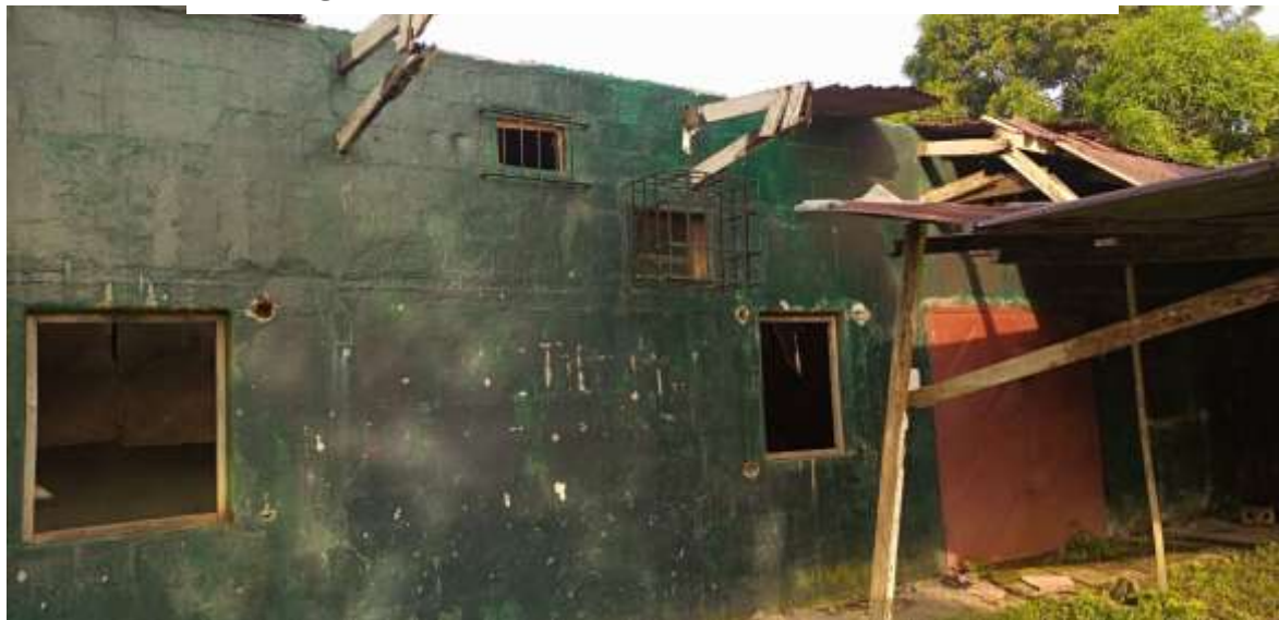
Figure 9.0 Renovation of Recreation Hall: Front View