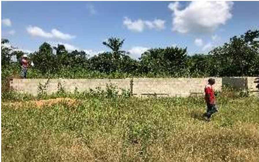
Elementary School under Construction in Malonkai Town

Community provided sand and crushed rocks for the project, dug the foundation with no pay but were provided food, accordingly to the Town Chief. Construction of the Elementary School started but work stopped at window level. From views sampled and analysis of project itself, the project is at a standstill though citizens labeled it as being abandoned. As per the engineer's technical analysis, "the sand has foreign materials as well as the rocks which he thinks do not suit the construction work because those items are not up to standard".