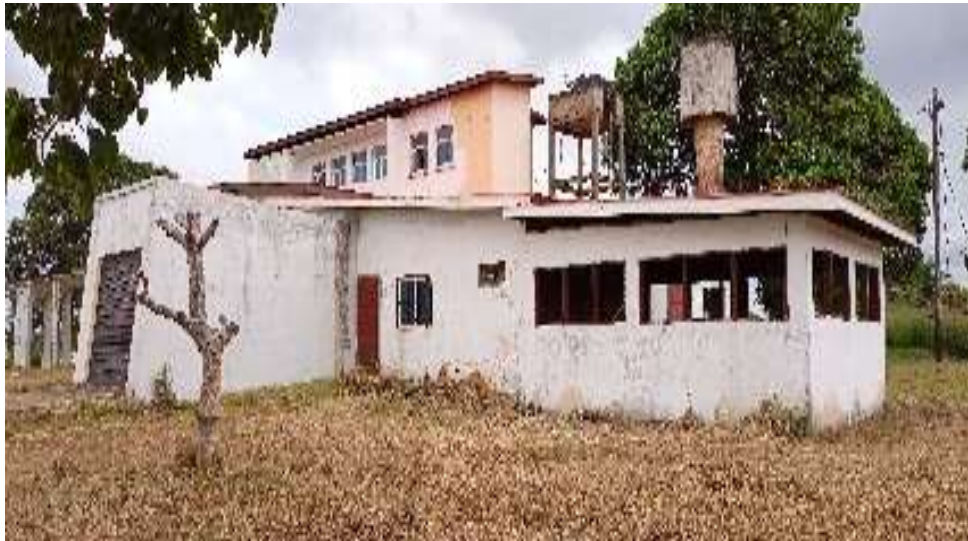
Pictorial of Superintendent Residence

The Superintendent's Compound is the official residence of Bong County Superintendent and government officials or guests who visit the County are also hosted in this building. More details in the engineer's report.