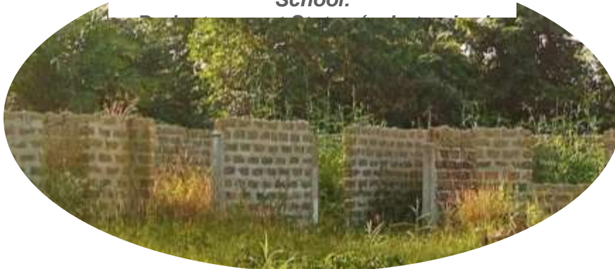
Figure 5.0 Construction of Elementary School: Project site view