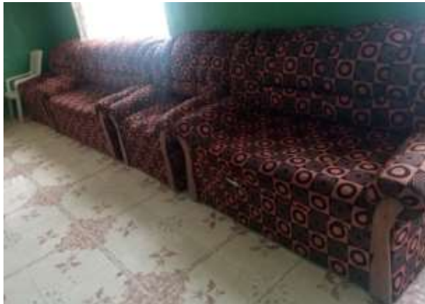
Chairs purchased for Town Hall in Wainsue

The 2018 County Sitting, held in Gbarnga apportioned US$ 5,000.00, for purchase of chairs