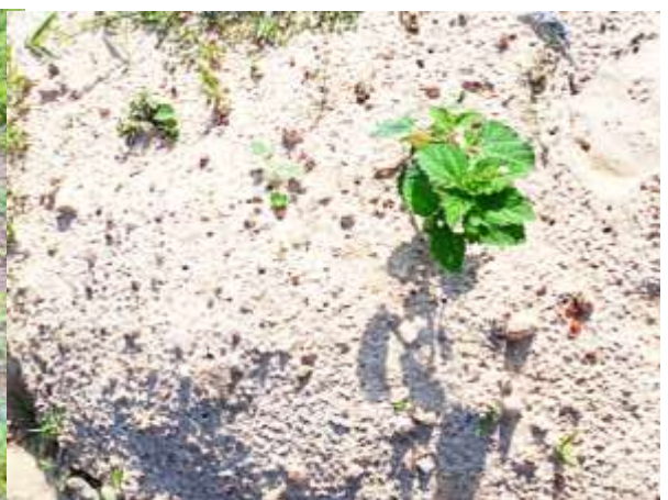
Figure 7.0 Sand mixed with foreign material (Substandard Materials)