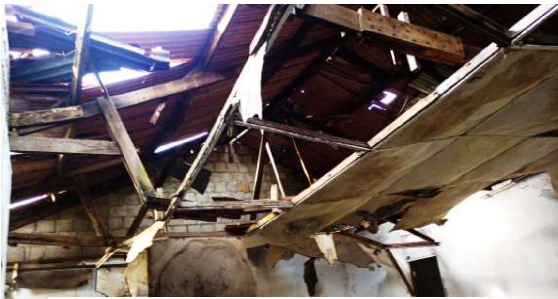
Figure 10.0 Renovation of Recreation Hall: Damage Roof & Ceiling View