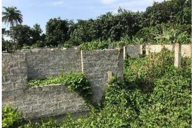
Clinic Project in Gbamokollie-ta

60%, constituting US$ 15,000.00 of project cost, has been paid. According to the engineer, the materials used (like the sand and rocks) are substandard and the amount paid is more than the work being done now.