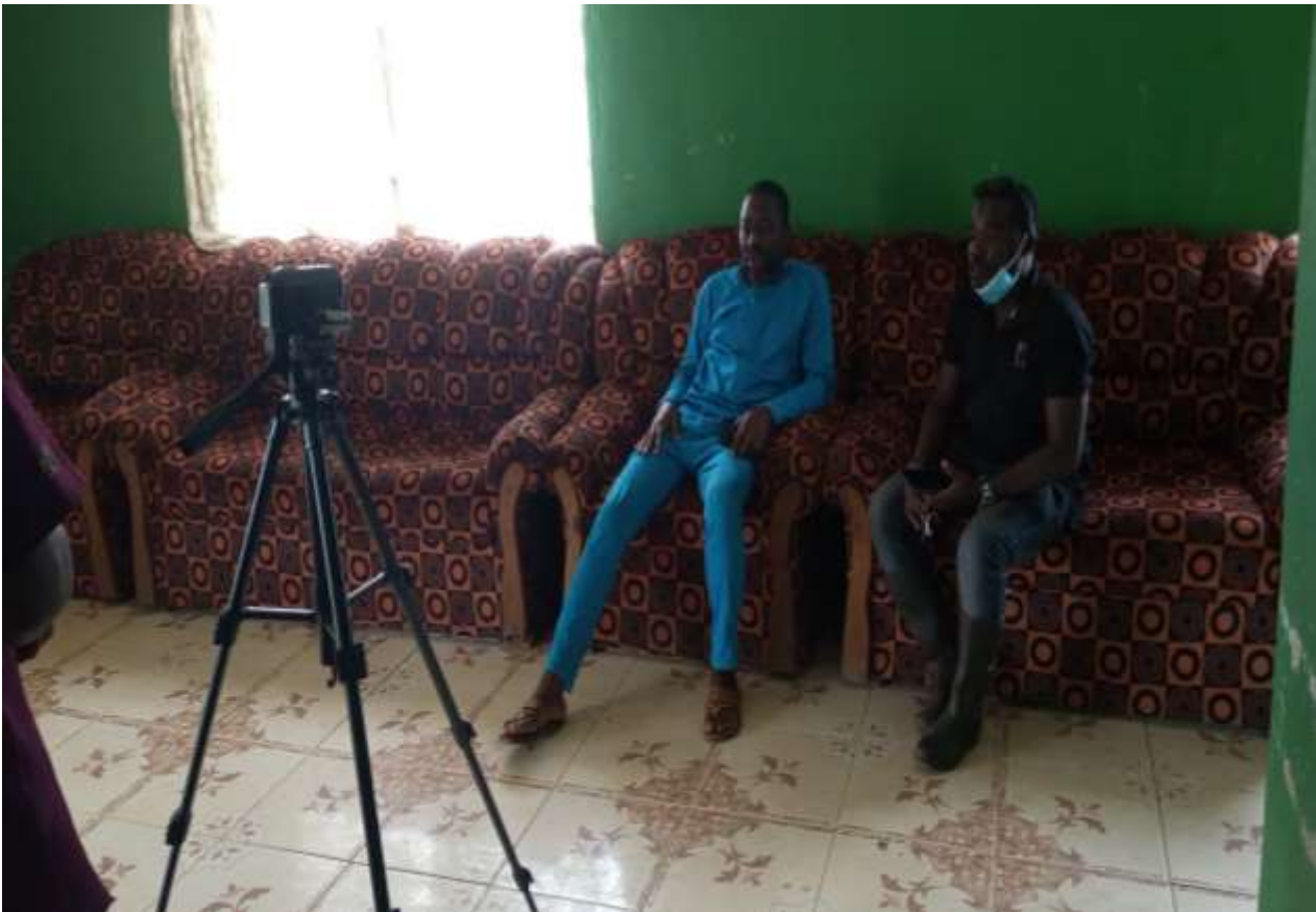
Figure 18.0 Four African Designed Chair for Wainsue Town Hall (Overestimated)

This is photograph of the four (4) set of living room chairs.