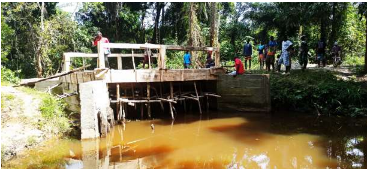
Figure 2.0 Gbarlorkpalah Bridge Project: Site View (Substandard Work)