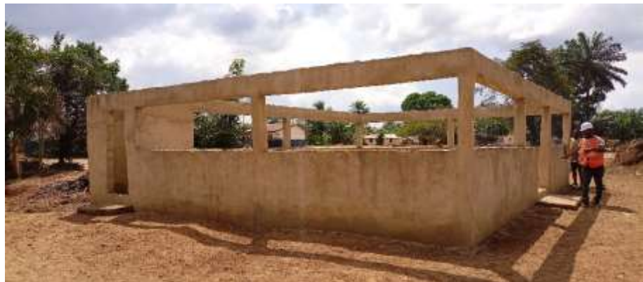
The Under-construction Town Hall of Gbarney in District 3

As in the case of every structured community, Gbarney needed a Town Hall wherein community people would gather to hold community discussions and/or wherein citizens to express their opinions, etc. And to save them of embarrassment faced most time when local government officials or politicians visit the community either to hear from them on topics of interest or to discuss specific issues, the people of Gbarney decided to look out for assistance to construct a Town Hall.