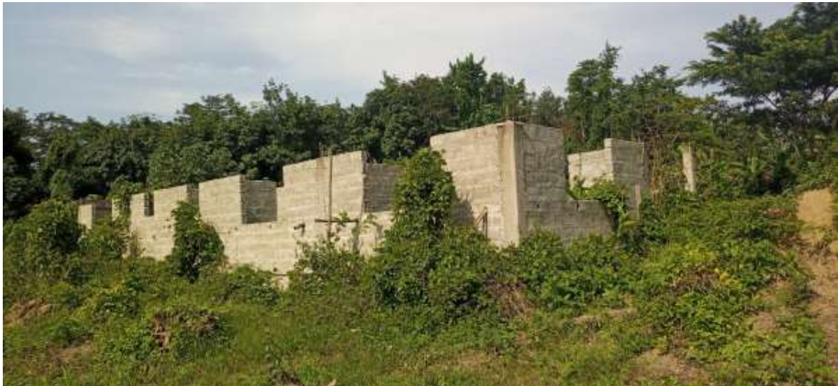
Figure 46.0 Clinic Construction: Project Site View

Now, taking into consideration of local materials provided by the citizens, the US$ 25,000.00 is too huge.