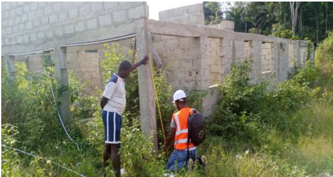
Figure 32.0 Clinic Completion: Project Current View