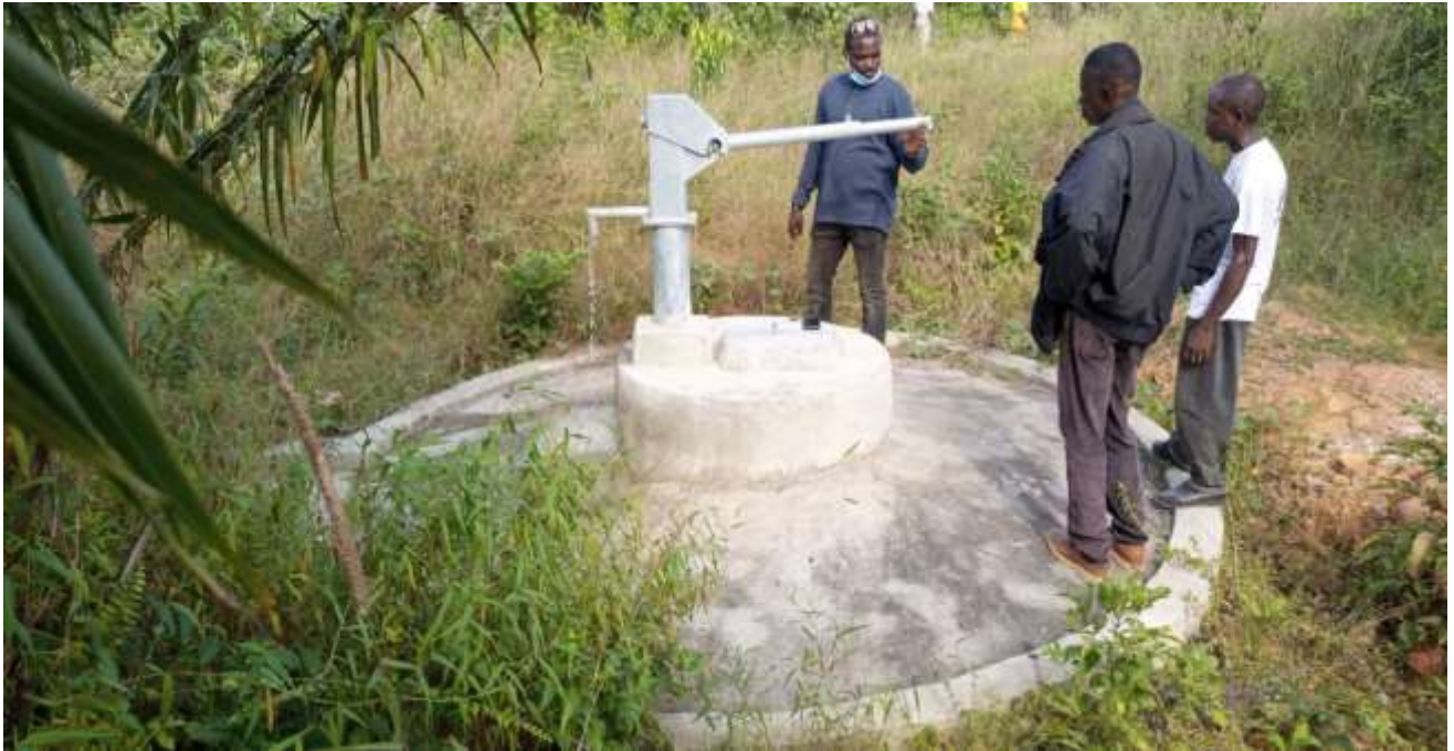
Figure 21.0 Hand pumps for four communities: Completed hand pump in Karyata (Standard)