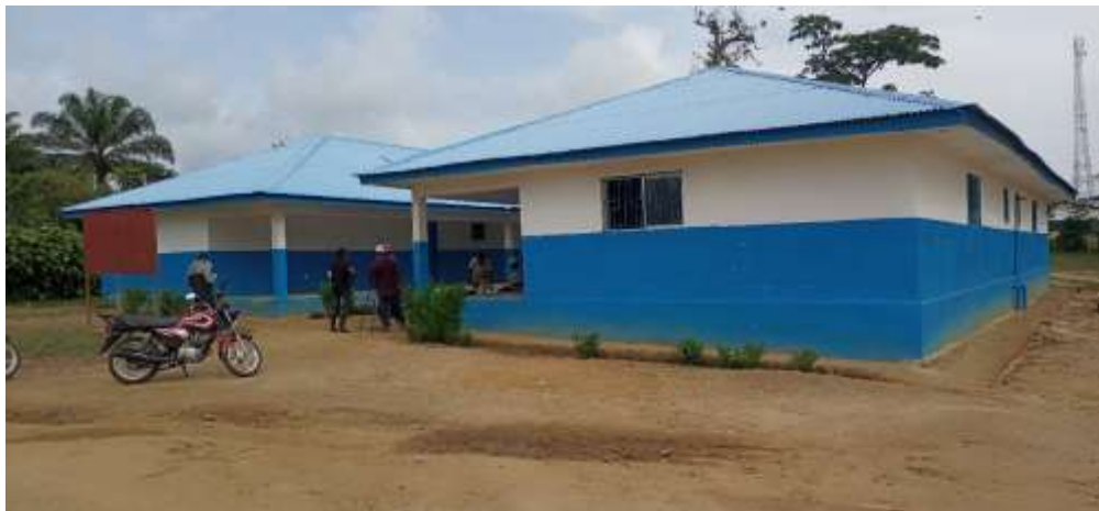
Figure 40.0 Foequellah Maternal Waiting Home Completion: Project Current View

Now, looking at the money that was budgeted for the completion and the level of works being done on the building, they do not commensurate with the work done, i.e. the amount budgeted is very huge for the level of work done. This project was far overestimated.