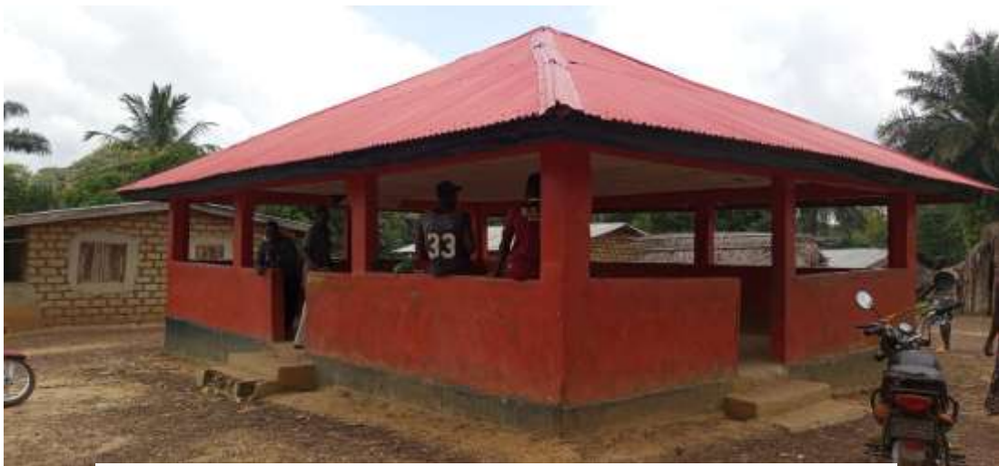
Figure 37.0 Kparyah Town Hall Construction: Project Current View

The building's height is very low (7'x1") considering its purpose, and the Town Hall constructed does not commensurate with the amount.