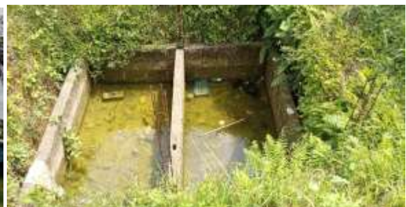
Septic tank of the constructed Annex to Salala Clinic