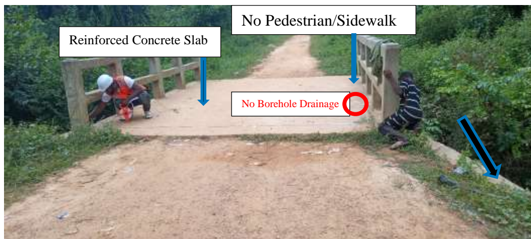
Figure 29.0 Sheankpala Bridge Construction: (Substandard) & Overestimated