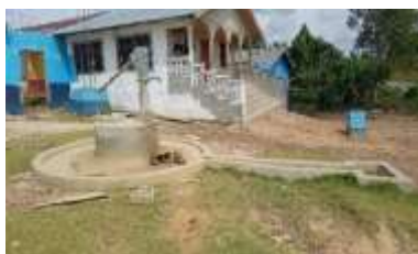
One of the hand pumps built in Zeansue