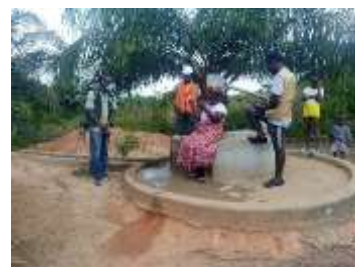
One of the hand pumps built in Boi-Ta