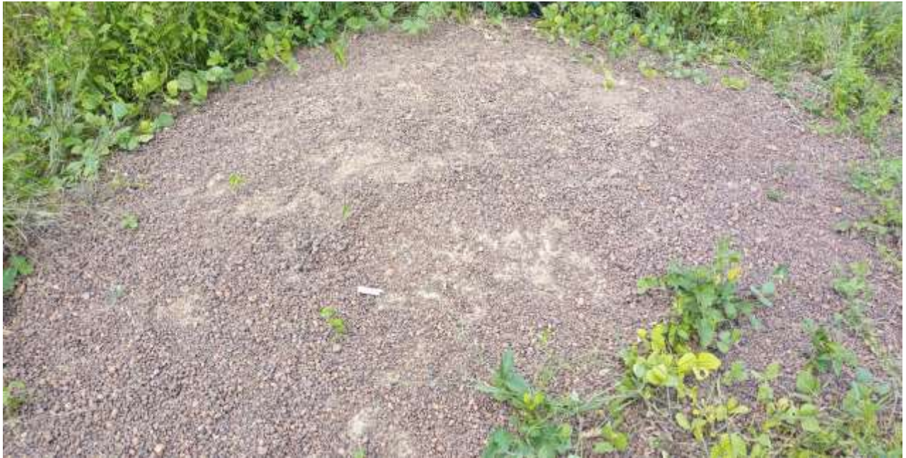
Figure 31.0 Elementary School Construction: Substandard Rocks