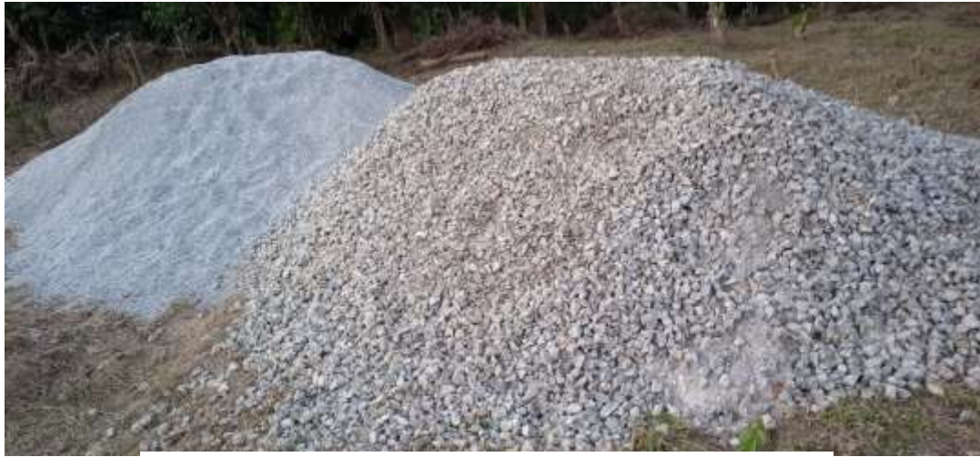
Figure 24.0 Meleen-ta town hall: Proposed Project Site