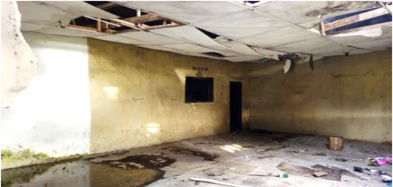
Figure 8.0 Renovation of Recreation Hall: Inside view