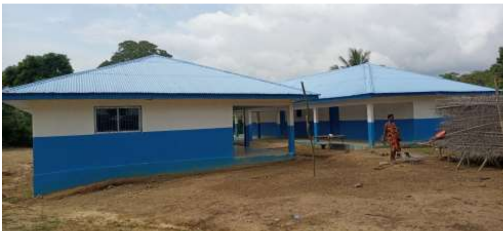
Figure 41.0 Foequellah Maternal Waiting Home Completion: Project Current Back View