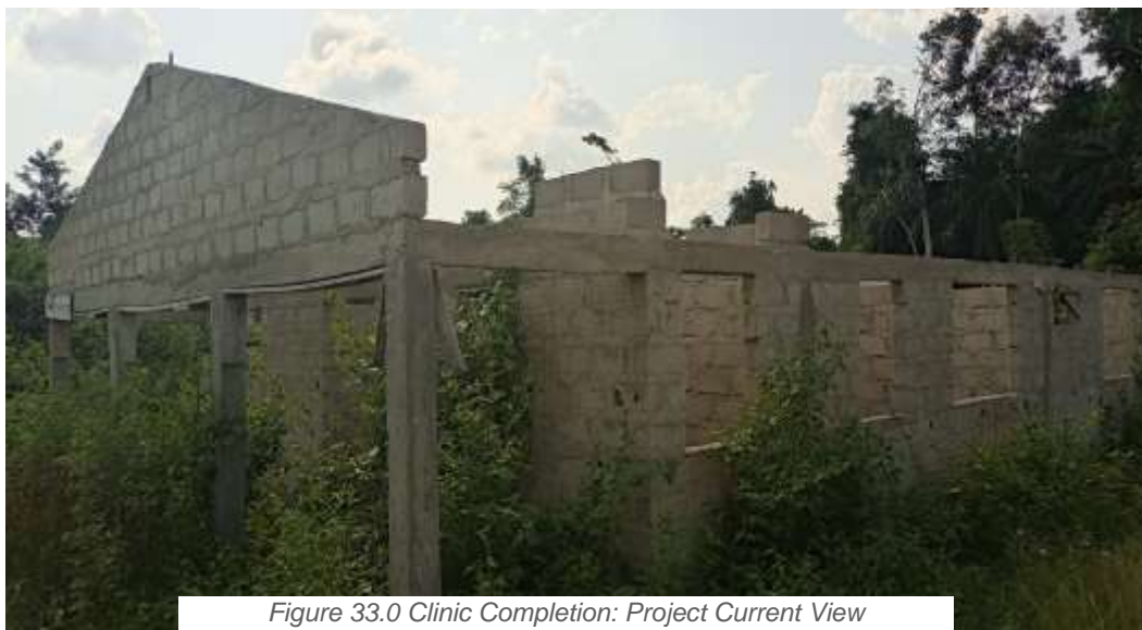
Figure 33.0 Clinic Completion: Project Current View