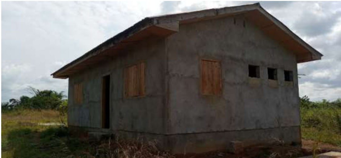
Figure 45.0 Construction of Chief's Offices: Back view & Septic tank