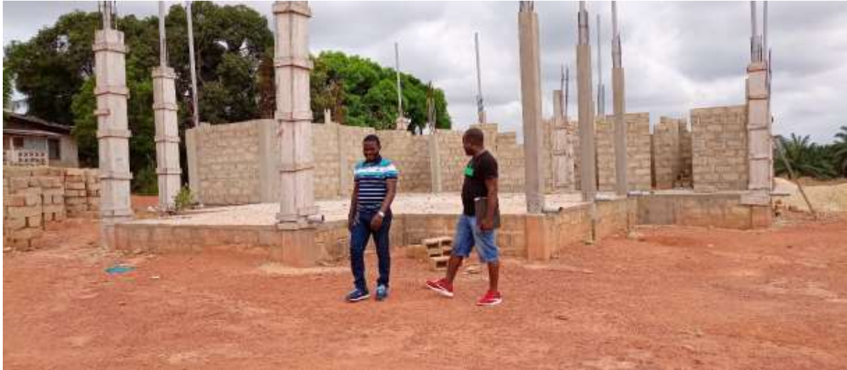
Under Construction Library Project in Gbarnga City

However, the team observed that construction work has started. With the contribution of 2000 bags of cement by the President of the Republic and payment of US$ 50,000.00 against the project, it seems unclear why the project has stopped and that the general work done on structure isn't gotten the building at lintel level or roof level at least.