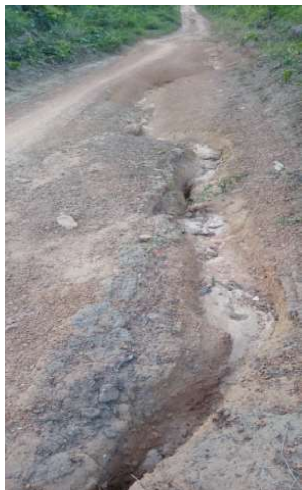
Figure 11.0 Rehabilitation of 6.8 Kilometers road: (Substandard work)