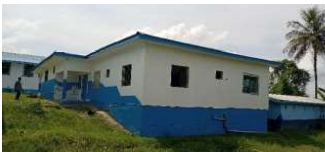
Constructed Annex to Salala Clinic