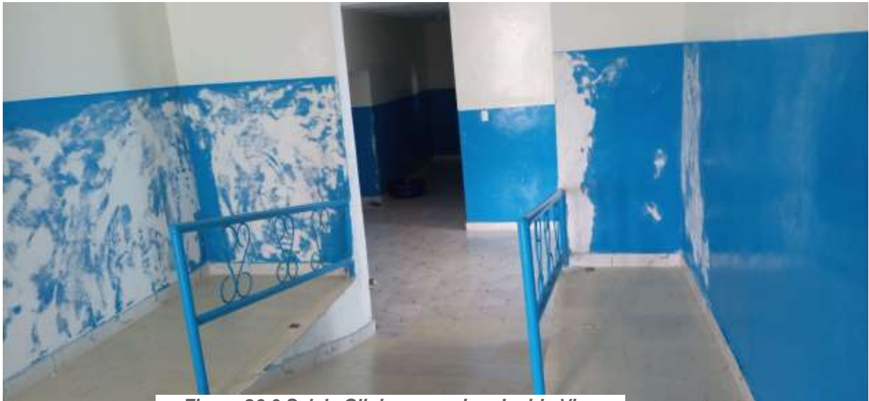
Figure 26.0 Salala Clinic expansion: Inside View