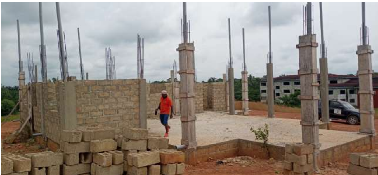
Figure 42.0 Library Construction: Project Site Current View

Now based on the current status of the building, taking into consideration the amount paid US$ 50,000.00, including the materials used and the dimensions of this building, it is evident that the amount is very huge for the work performed so far.