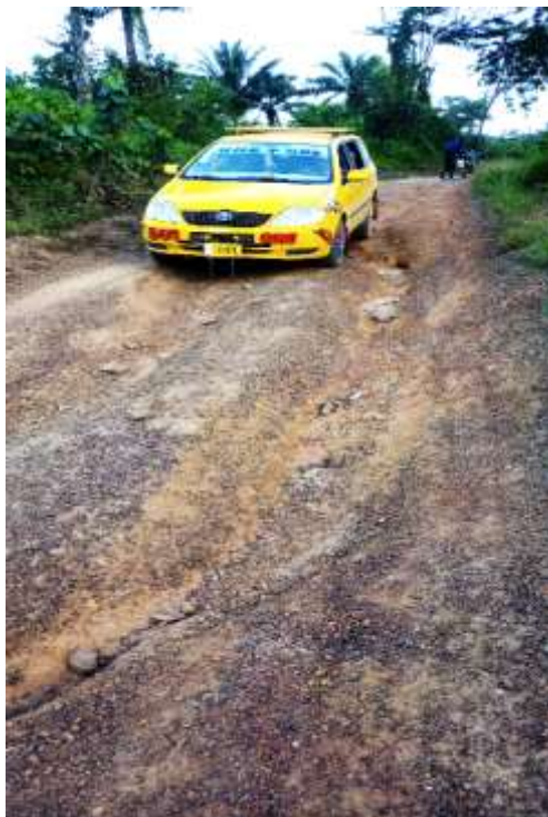
Pictorial of the rehabilitated Meleen-ta Road