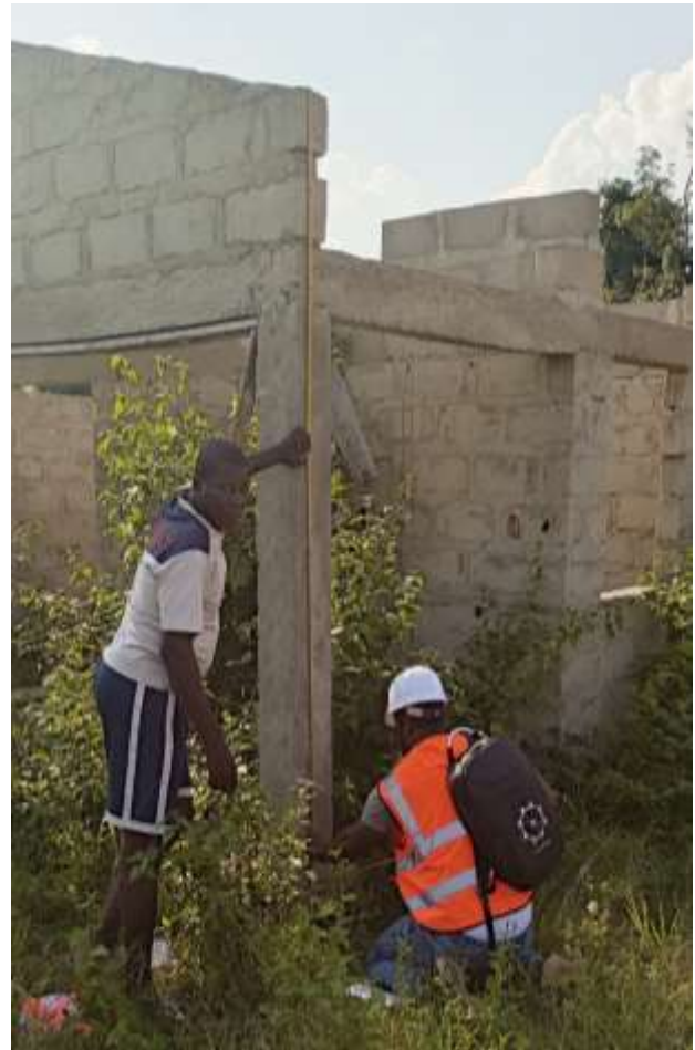
Figure 34.0 Clinic Completion: Substandard Rocks