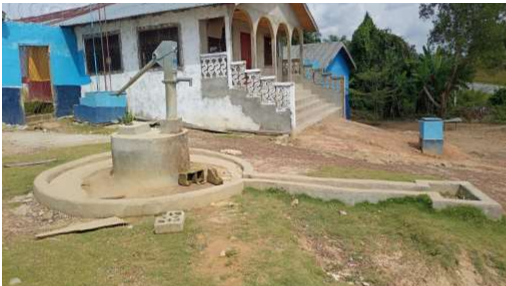
Figure 20.0 Hand pumps for four communities: Completed hand pump in Zeansue (Standard)