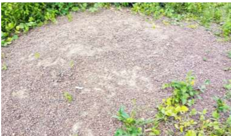
Figure 6.0 Laterite Rocks with Foreign Material (Substandard Materials)