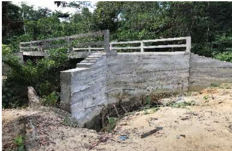
Constructed Baryata Bridge in District 2