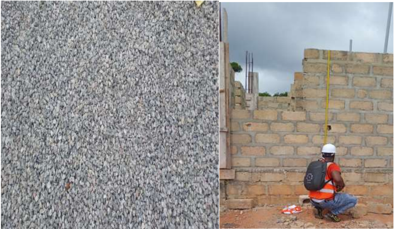
Figure 43.0 Library Construction: (Standard Rocks)