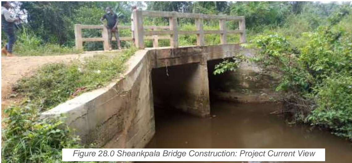
Figure 28.0 Sheankpala Bridge Construction: Project Current View