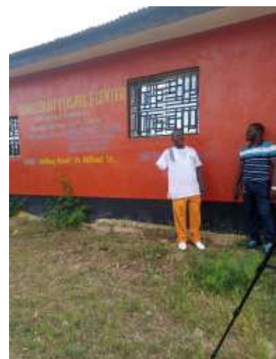
Renovated Bong County Disable Center