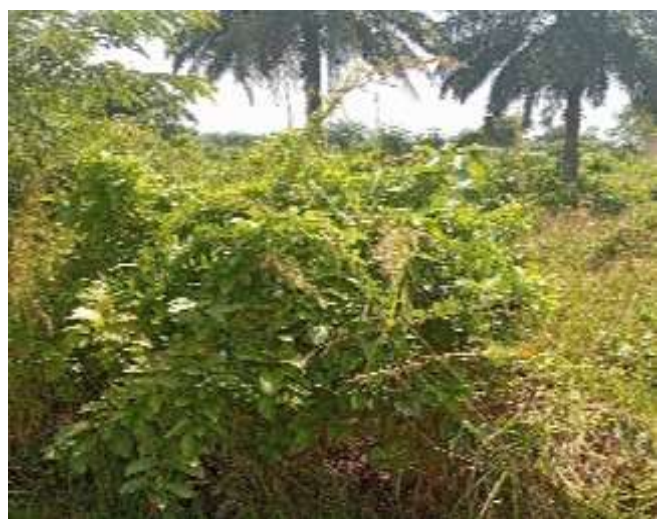
Maternal Waiting Home in Sanoyea