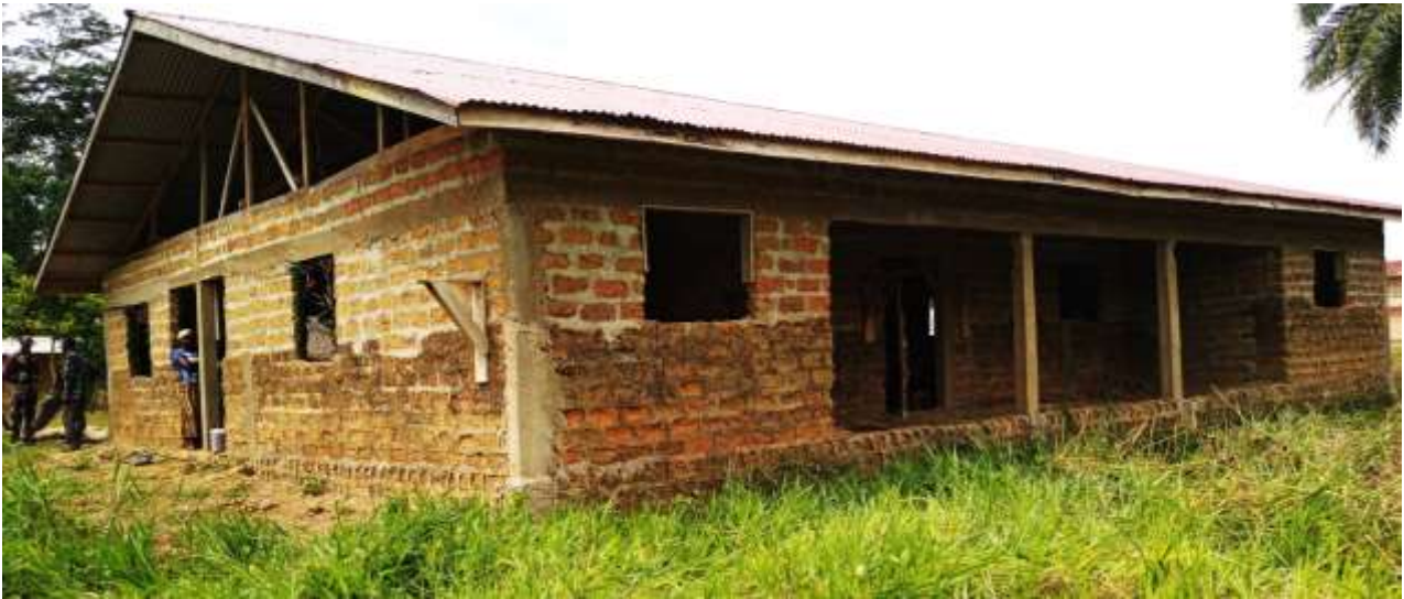
Figure 1.0 Jorwah youth center completion: Substandard blocks & Zinc used)

This building is in a rectangular position dimensioned or measured at 55'-8" by 38'-8" with 8'-0" high and front porch extended inward. Structure is also built with 6"x 6" x 16" dirt blocks, 1" thick cement mortar joined and ten (10) reinforced concrete pillars from the extremes and centers. Additionally, the contractor started constructing this building from 3'-6" level up to 8'-0" level/height, meaning 4'-0" was added by the contractor.