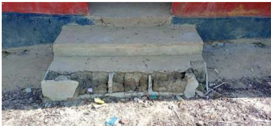
Figure 38.0 Kparyah Town Hall Construction: Damaged Step (substandard material)