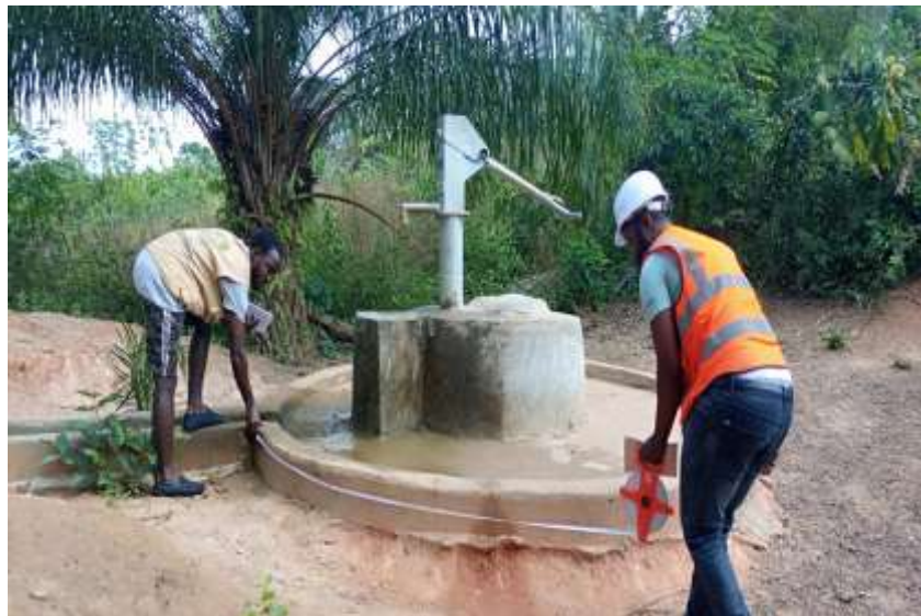
Figure 19.0 Hand pumps for four communities: Completed Hand Pump in Boi-ta (Standard)