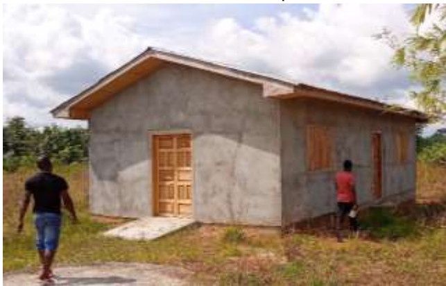
Commissioner Compound under construction in Zeansue

The construction of Chief Compound in Zeansue is one of the four-in-one Chief Compounds Project captured in the 2018 Resolution for construction, to which, the amount of US$ 40,000.00 was allotted.