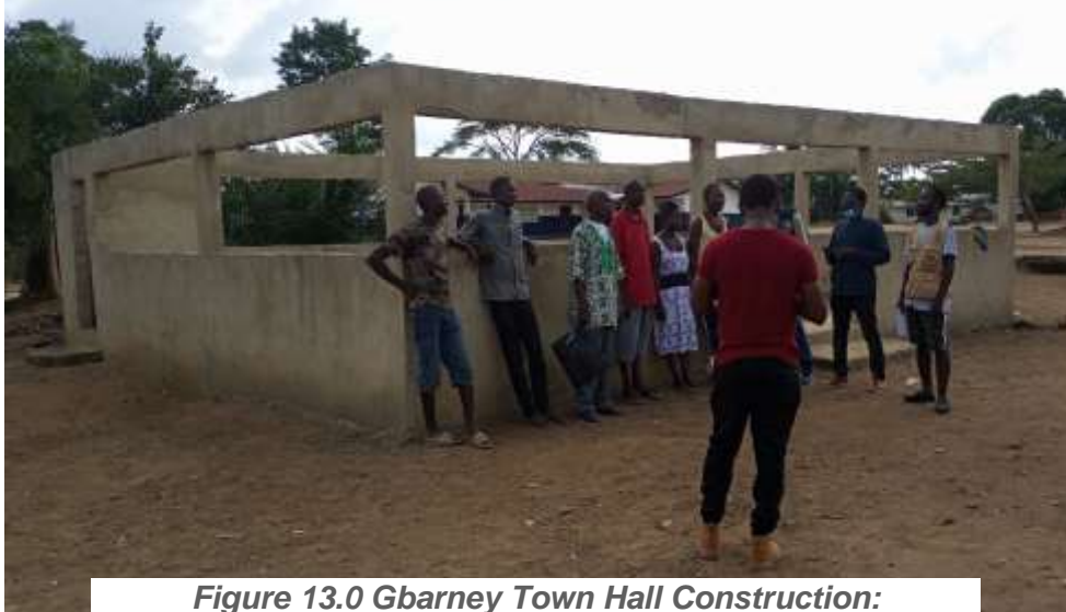
Figure 13.0 Gbarney Town Hall Construction: