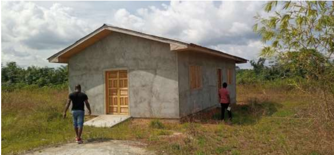
Figure 44.0 Construction of Chief's Offices: Project Current View (Standard) But Windows Substandard